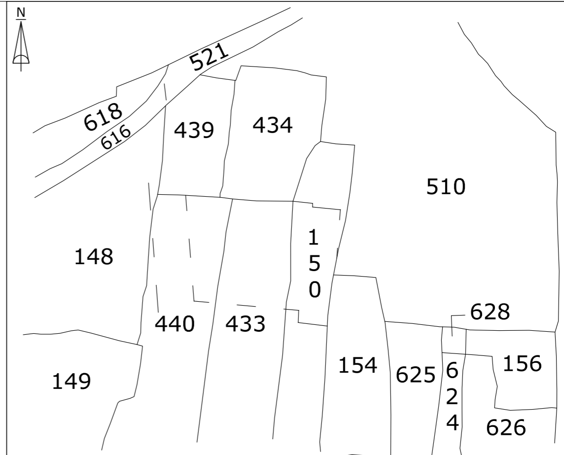
PART TRACE MOUZA. DABGRAM, J. L. NO. 02, SHEET NO. R.S. 9, P.S. BHAKTINAGAR, DIST. JALPAIGURI, SCALE.:- 16"= 1 MILE, PROPOSED PLOT SHOWN.